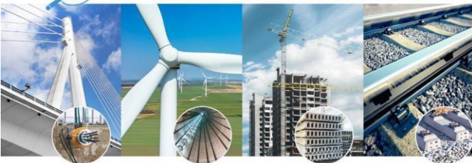
NEDRI SPANSTAAL BV, STRETCHING THE BOUNDARIES

program operator Stichting MRPI® publisher Stichting MRPI® www.mrpi.nl